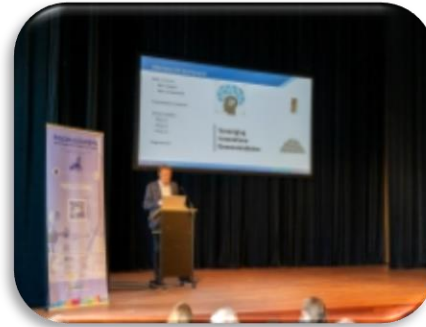
Parallel session FIGON & EUFEPS European medicines days