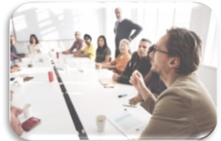
Expertmeeting regulator- initiated studies