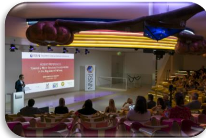
RSNN Annual workshop